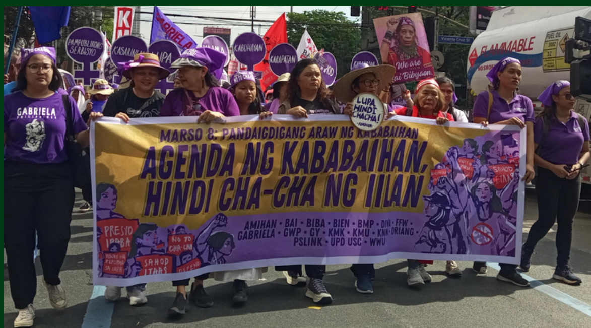
Indigenous women march with the women's sector in protesting against ChaCha ang pushing for women's agenda.