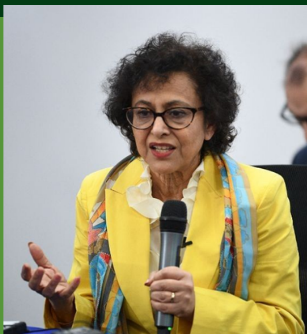
SR Irene Khan's visit to the Philippines.

In a significant visit to the Philippines, United Nations Special Rapporteur on Freedom of Opinion and Expression Irene Khan emphasized the essential need of sustaining and protecting the country's fundamental freedoms. Khan's visit comes at a time when there are growing worries about press freedom and free expression both domestically and abroad.