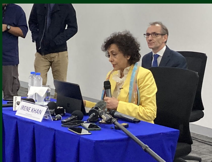
Irene Khan, UN Special Rapporteur on the promotion and protection of freedom of opinion and expression, recommends the abolition of the "outdated" NTF-ELCAC and the issuance of an executive order against red-tagging.

As Special Rapporteur, Khan's visit serves as a reminder that respecting human rights, especially freedom of opinion and expression, is not just a moral obligation, but also a foundation for democracy and effective government. It is essential to all stakeholders, including the Philippine government, to collaborate to guarantee that these fundamental rights are respected and protected for all people, regardless of background or views./