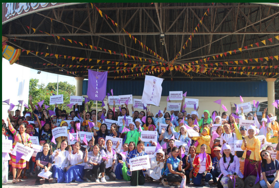
Women's Month Community Action 2024 at the Midsayap Municipal Plaza with Eumanen ne Menuvu, Teduray, Lambangian, Kirinteken, Pulangiye, and Manobo women.

Every year, LILAK celebrates International Women's Month to remember the bravery of all women who fought for women's human rights worldwide. It is a time when we celebrate the women who offered their lives, stood up, and raised women's voices, place, and status in different aspects of society. Ultimately, this month is more than just a celebration. It is a protest where women continue to assert and demand a better life and meaningful participation in all spaces.