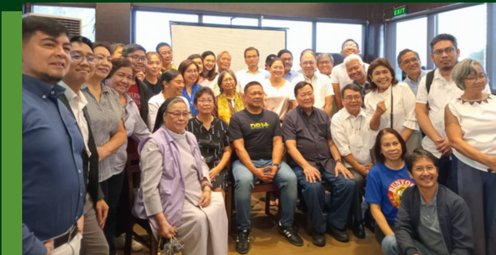
Participants and speakers at the meeting of a broad network

The move to amend the 1987 Constitution has been rife with legal issues and political controversy. The “People’s Initiative” as a mode for constitutional amendment propelled by some politicians for their dynasty’s political interests was done in surprise and speed, shocking the masses and even their fellow politicians. People were distracted by and caught in between a mere political factional fight between Marcos and Duterte.