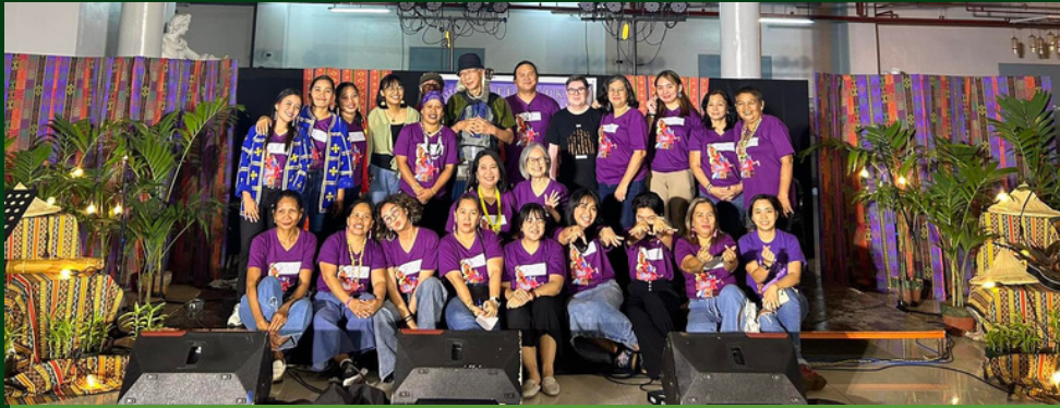
Fëgëlukës at Linggëng artists with producers LILAK and AMP3 in the album launch event held at UP Fine Arts Gallery.

Women’s Month is a protest, and protests can take many forms, including music. In collaboration with Asian Music for Peoples’ Peace and Progress (AMP3), LILAK previously organized a songwriting workshop for indigenous women in March 2023 to provide a safe space for indigenous women to share their stories and struggles and express their activism through music.