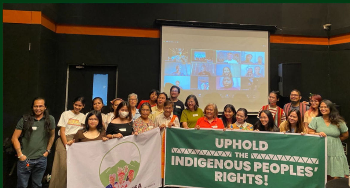
The Panaghiusa Philippine Network at its 2nd National Assembly

Last February 26, 2024, the Panaghiusa Philippine Network held a successful second National Assembly in Quezon City.