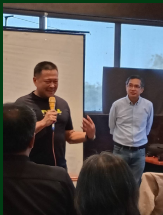
Sen. JV Ejercito gives an update from the Senate

All networks were urged to call on their formations across the country in order to educate the public about the truth behind this People's Initiative (PI) and attempt at Charter Change, launch campaigns to counteract the signature campaign of the PI, and mobilize the people in joining the broad February 25 mass mobilization to voice out the calls for genuine democracy and nationalism, reinvigorating the spirit of the People Power Revolution./